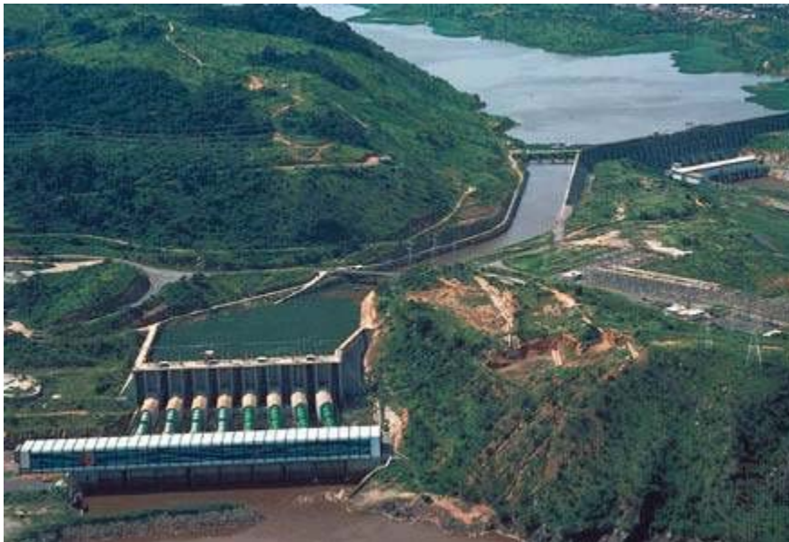
Figure 1 - Local Hydroelectric Complex

The local distributed generation power grid is a loosely connected system of hydroelectric generation, fossil fuel and coal plants connected primarily to local transmission and distribution systems. The largest single centralized power generation system is through a local hydroelectric plant. See Figure . The facility supplies power to most primary and secondary Urban Centers. The high voltage transmission lines appear to be in good repair where they were observed along Highway 1